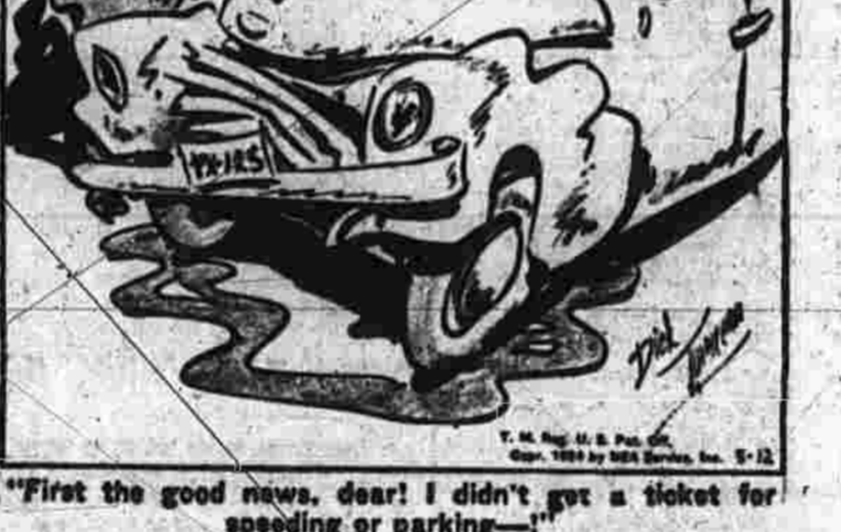
FIRST THE GOOD NEWS, DEAR I DIDN'T GET A TICKET FOR SPEEDING OR PARKING

Personal Notices. A section for personal notices and announcements.