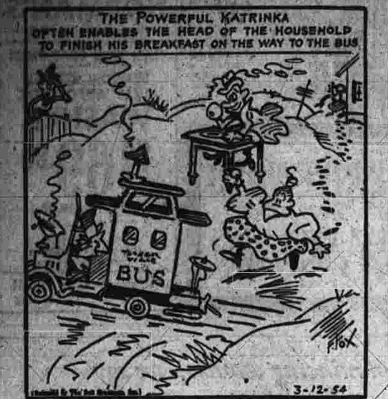
THE POWERFUL KATRINKA OFTEN ENABLES THE HEAD OF THE HOUSEHOLD TO FINISH HIS BREAKFAST ON THE WAY TO THE BUS