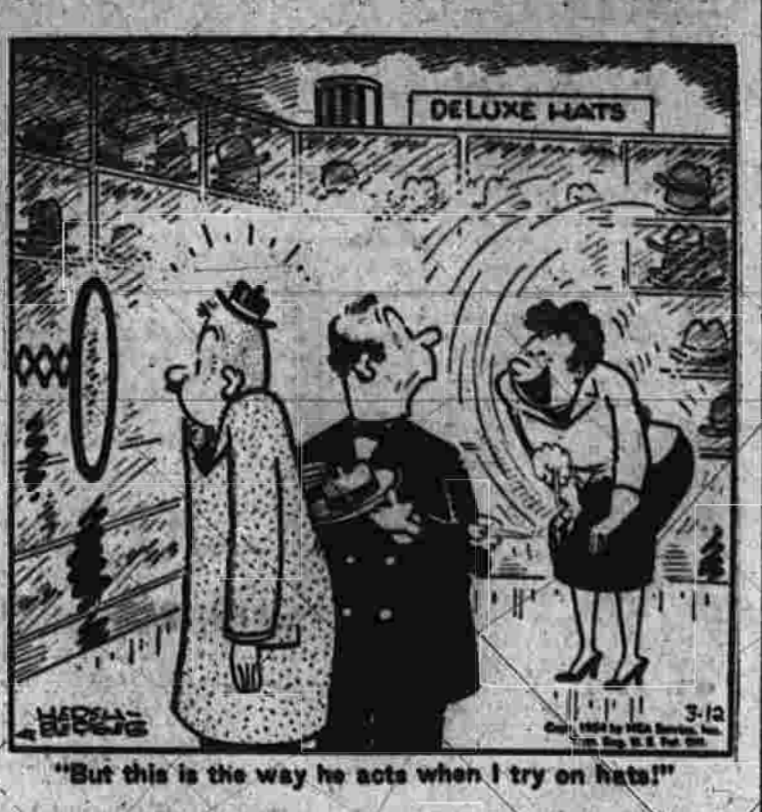
"But this is the way he acts when I try on hats!"