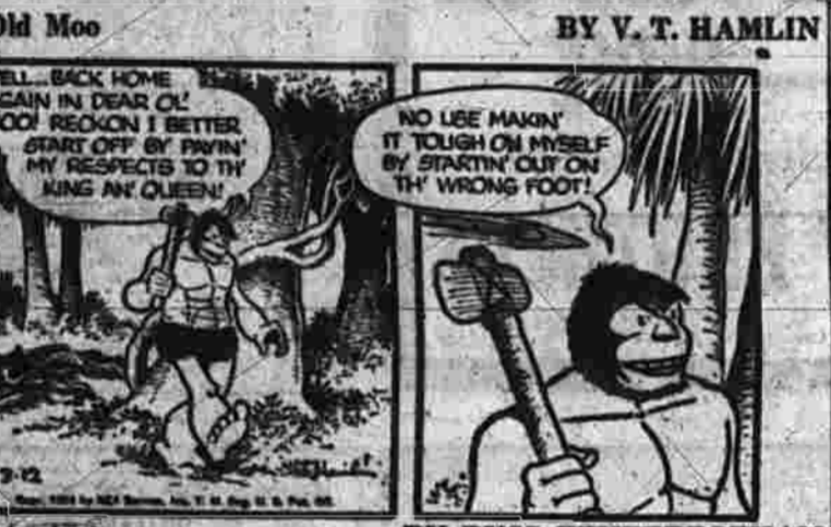
IN DEAR OLD MOO